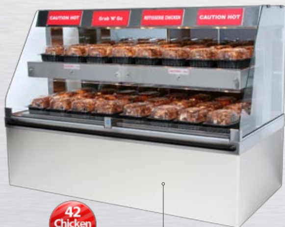
2-Tier Zone 6