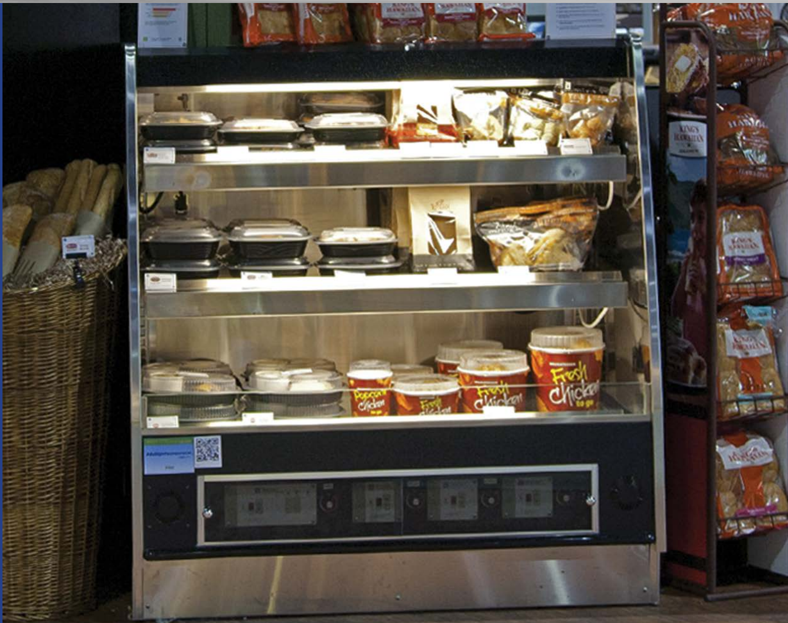
Photo may depict options not included on standard models.

Hot deli merchandiser for pre-packaged hot food items with convection assist.