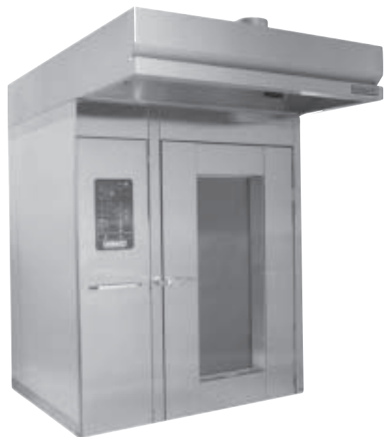
NOTE: Above shown with advanced control panel

Specifications, Details and Dimensions on Back.