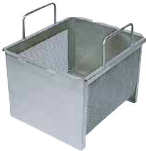
Bulk Pasta Basket 823-7384 & 823-6290