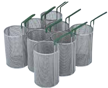
Round Pasta Baskets 803-0238